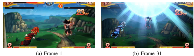
Fig. 1: Hit stop in Dragon Ball FighterZ