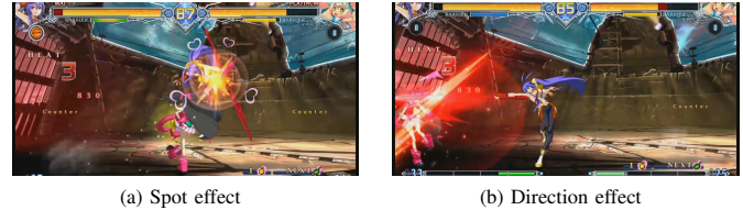
Fig. 2: On-hit effect in BlazBlue Centralfiction

B2.1 On-Hit effect. The difference to after-hit effect, described above, is that those are effects applied to communicate the impact of your strike. While the on-hit effects are spot-pattern effects that try to highlight the hit's position. Besides, on-hit effect can express more than just pointing out the impact position. Some games will apply on-hit effect with different patterns to distinguish the armaments used. Figure 2 shows that the on-hit effect varies for various weapons in BlazBlue Centralfiction 13 . The spot pattern is employed for fist and blunt objects, while an extra directional effect is applied when sharp weapons like spear and sword have slashed at the target.